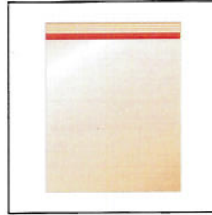
Tinted Plastic Bag