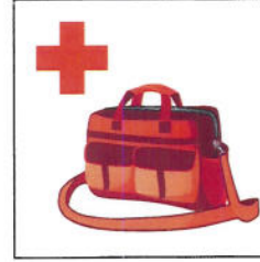
Medically Necessary and Diaper Bags*

*Infant and Medical supplies will be permitted after proper inspection.