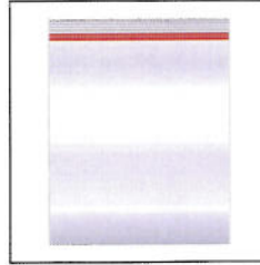
1-Gallon Plastic Freezer Bag