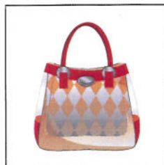
Printed Pattern Plastic Bag