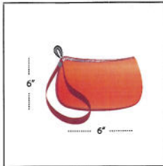
Bags smaller than 6" x 6" x 6"