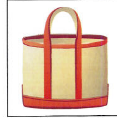
Over-sized Tote Bag